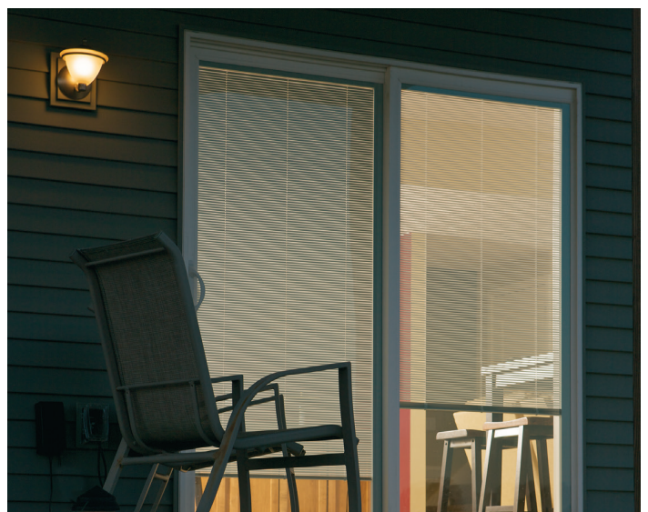
SLIDING PATIO DOORS